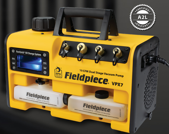
Vacuum Pumps VPX7, VP87, VP67