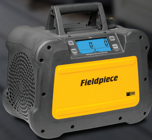
Recovery Machine MR45