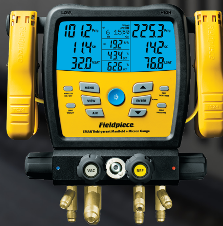
Refrigerant Manifolds SM480V, SM380V